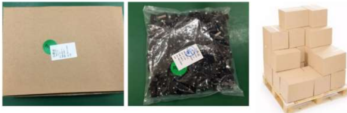
1. inner box 2. polybag 3. cartons for oversea